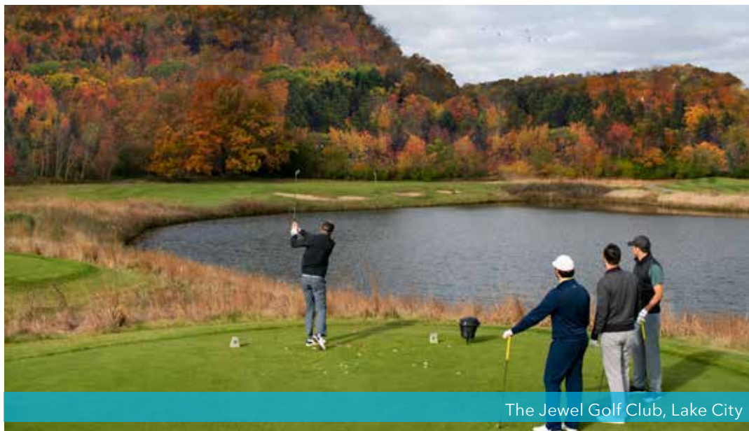
The Jewel Golf Club, Lake City

Website: princetongc.com Address: Golf Course Rd, Princeton, MN 55371 Region: NE Holes: 18 Par: 71 Type: Public Clubhouse: 763-389-2006