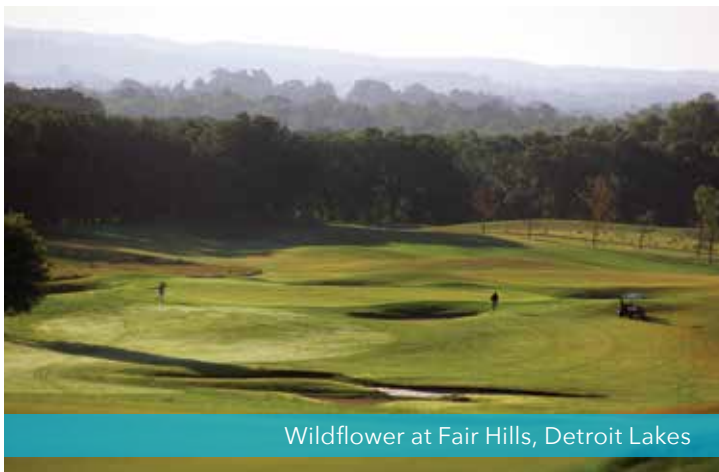
Wildflower at Fair Hills, Detroit Lakes