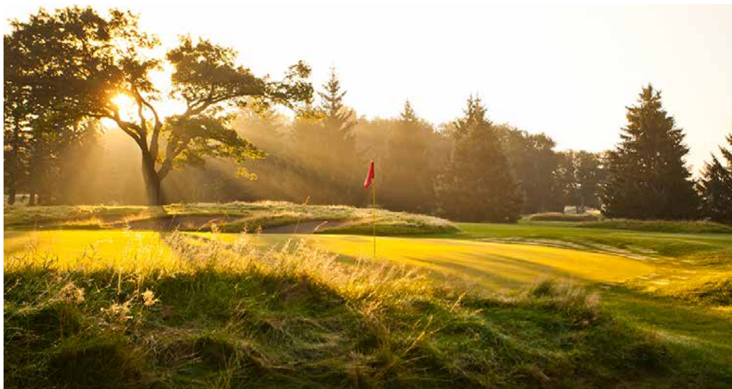
Pine Beach East at Madden's, Brainerd