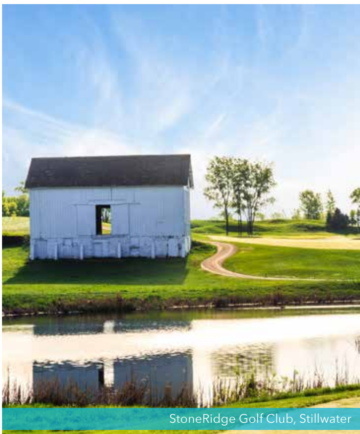
StoneRidge Golf Club, Stillwater