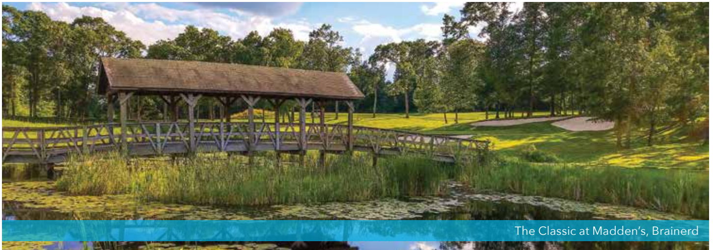
The Classic at Madden's, Brainerd