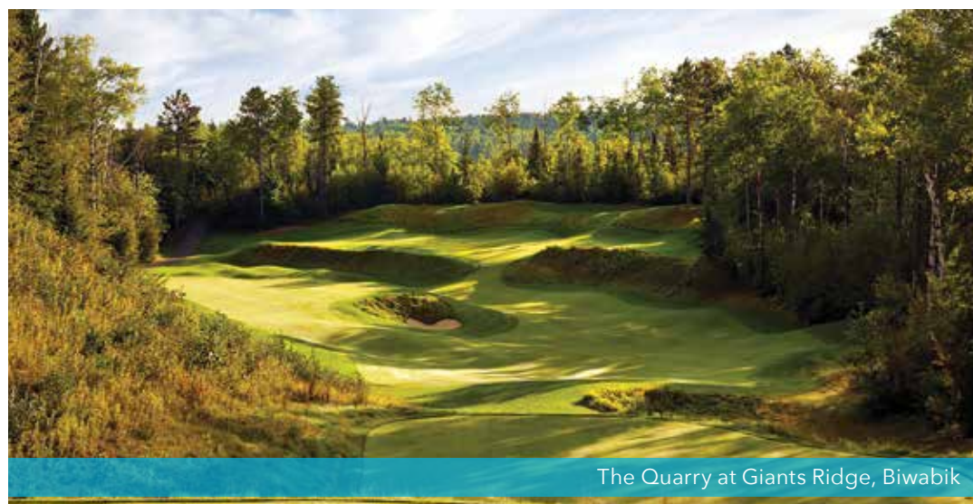
The Quarry at Giants Ridge, Biwabik