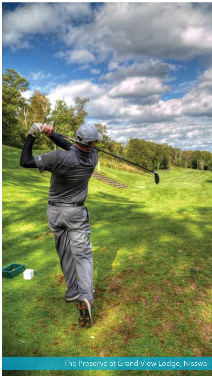
The Preserve at Grand View Lodge, Nisswa