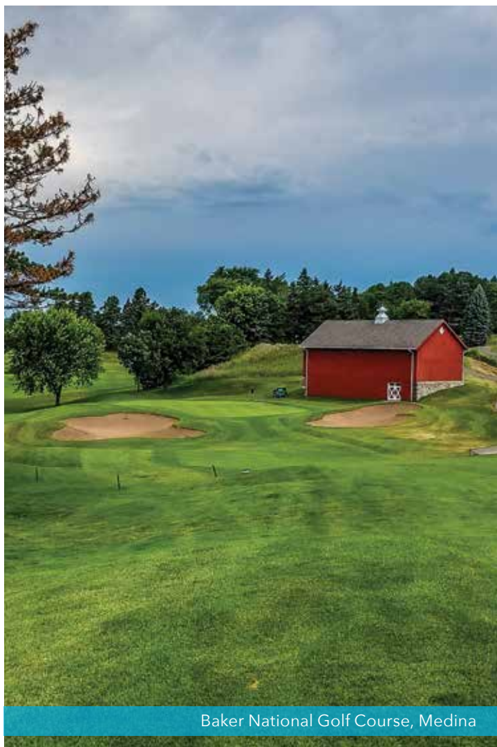
Baker National Golf Course, Medina