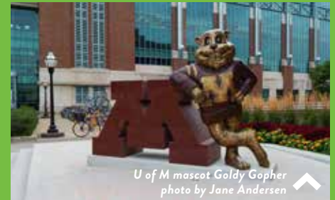
U of M mascot Goldy Gopher

First settlers arrive; primarily European Americans from the East Coast