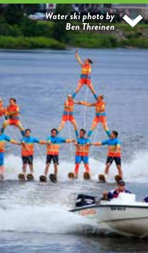
Water ski