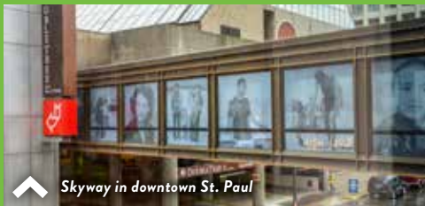
Skyway in downtown St. Paul