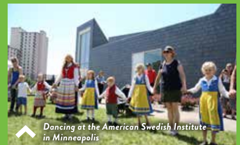
Dancing at the American Swedish Institute in Minneapolis

With the U.S. Government behind on payments to the Dakota for their land, and the Dakota experiencing widespread hunger, tensions mount and the U.S.-Dakota War of 1862 breaks out in southwest Minnesota