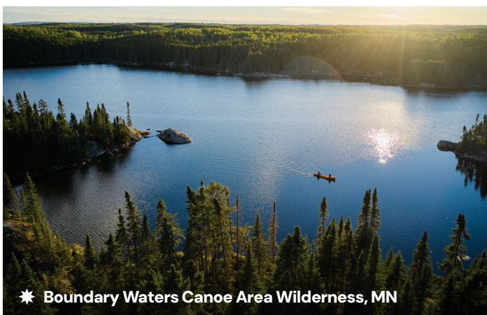
✦ Boundary Waters Canoe Area Wilderness, MN

Enjoy the stunning drive along Lake Superior as you head to Bayfield, a charming small town and one of the highlights of Wisconsin with its Apostle Islands Lakeshore National Park. Take a narrated Apostle Island Cruise (2.5 hours) to view the 21 islands from the water featuring unique landscapes, lighthouses, and sailing ships.