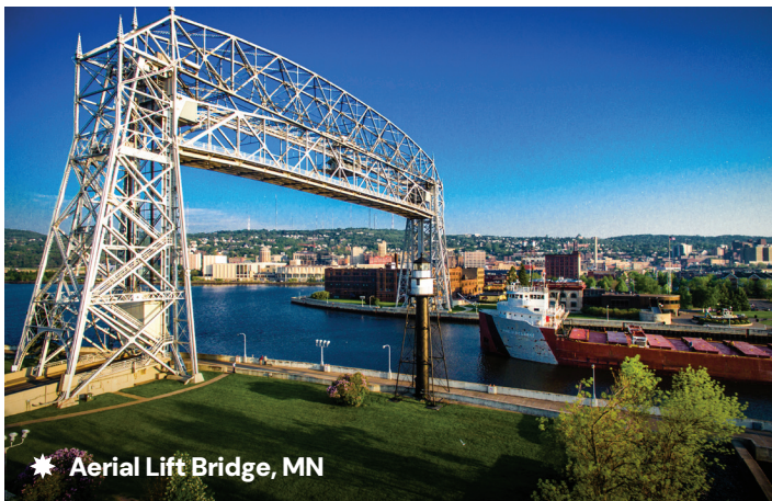
✦ Aerial Lift Bridge, MN