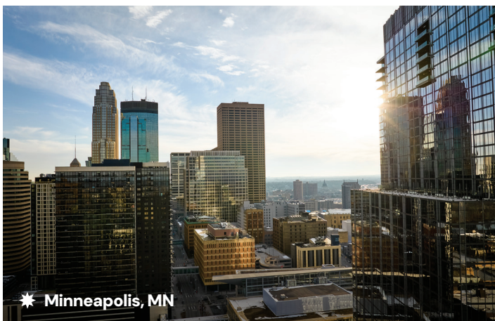
✦ Minneapolis, MN

Drive along the North Shore Scenic Byway, with stops at Gooseberry Falls State Park and Split Rock Lighthouse on the way to Ely. Home of the International Wolf Center and North American Bear Center, Ely is also a gateway to the Boundary Waters Canoe Area Wilderness, the only federally protected canoe area in the U.S.