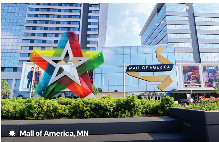
✦ Mall of America, MN

Time to "Shop til you Drop" at Mall of America, the largest shopping and entertainment complex in the U.S., with 500 stores, 50 restaurants, Nickelodeon Universe indoor amusement park, SEALIFE Aquarium and many other attractions. As a bonus, there's no sales tax on clothing or shoes in Minnesota. Before you depart for home, visit Paisley Park, the home and recording studio of Prince.