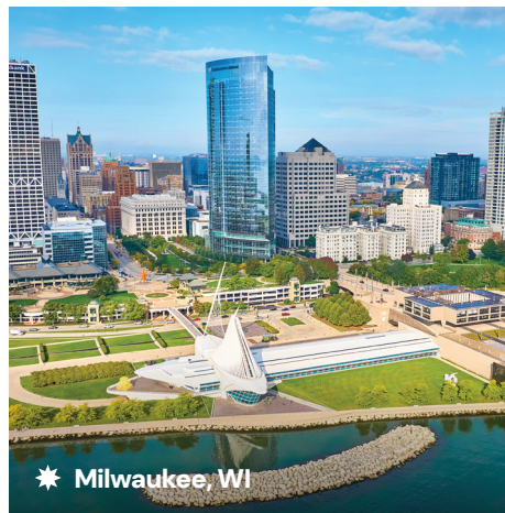
★ Milwaukee, WI