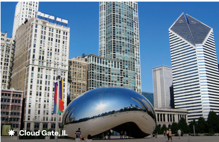
★ Cloud Gate, IL

Morning drive along Lake Michigan to Chicago. With almost three million inhabitants, it is the third largest city in the U.S. Chicago's skyscrapers are among the tallest in the world and the city is considered one of the birthplaces of modern architecture. Learn about the city's most interesting buildings and about the city's history in general on an architecture boat trip.