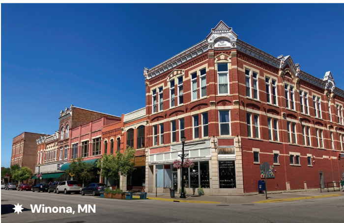
★ Winona, MN

Driving west from Chicago, stop in Rockford, Illinois. Nicknamed the Forest City, Rockford is known for its beautiful location on the Rock River. Take a stroll through the famous botanical gardens, especially the Anderson Japanese Gardens which is known as one of the most beautiful gardens in the U.S.