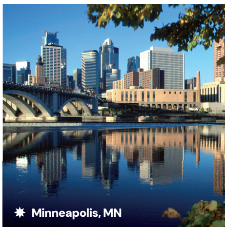
✦ Minneapolis, MN