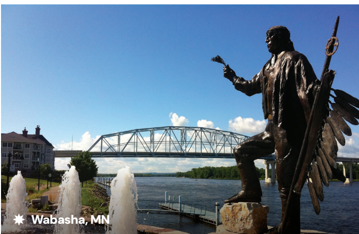
★ Wabasha, MN

Follow the Great River Road along the Mississippi River to arrive at the Minneapolis/St. Paul International Airport (MSP) for your flight home. Time to shop for some last-minute items at Mall of America, only five minutes from the airport.