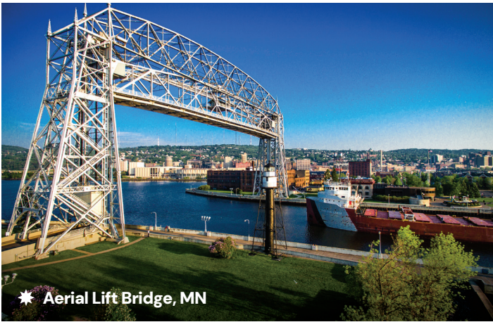
★ Aerial Lift Bridge, MN