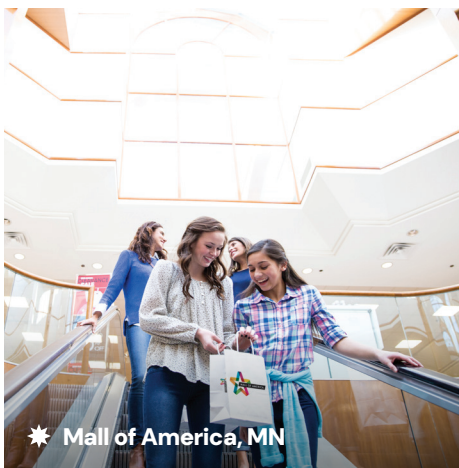
★ Mall of America, MN