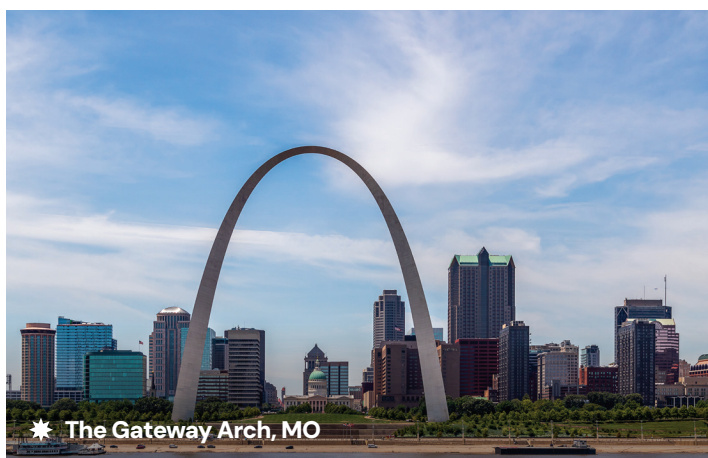
★ The Gateway Arch, MO