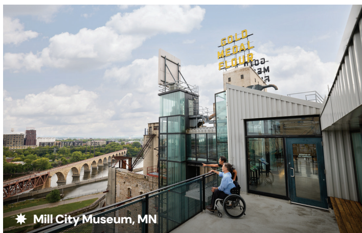
★ Mill City Museum, MN