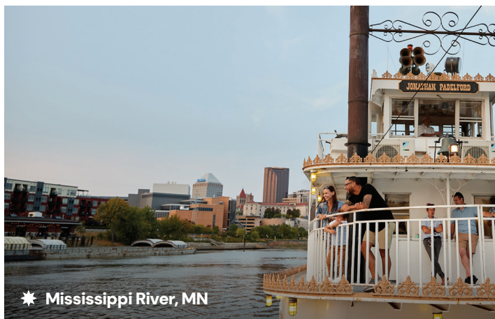
★ Mississippi River, MN