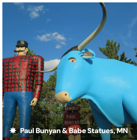
★ Paul Bunyan & Babe Statues, MN