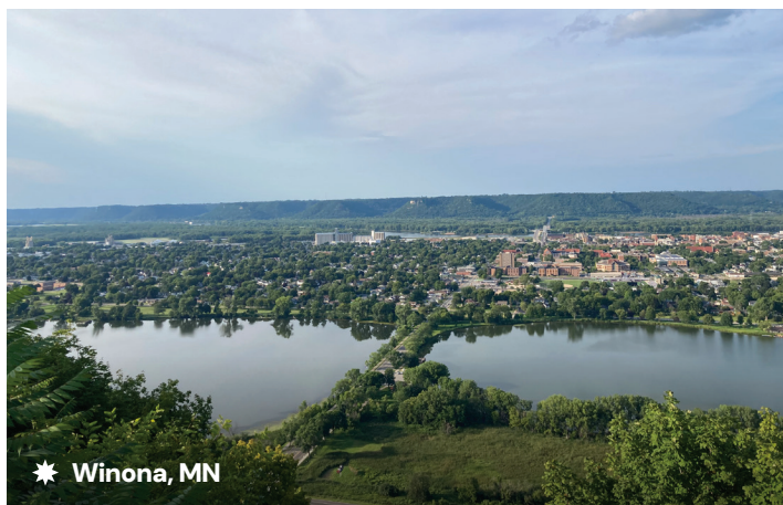
★ Winona, MN