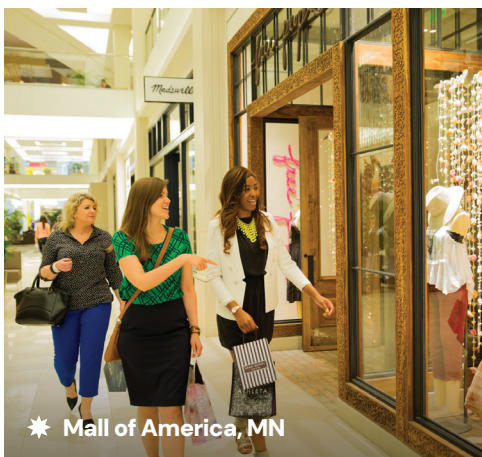
★ Mall of America, MN