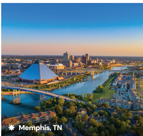
★ Memphis, TN

Before departing Memphis, visit the Stax Museum of American Soul Music, which pays homage to Soul and Gospel music, and features memorabilia from musicians like Otis Redding and Isaac Hayes. Next a stop at the Memphis Listening Lab offers an immersive experience, where you can explore the city's musical legacy through exhibits and rare recordings. End the tour with a stroll along the mighty Mississippi River, a tour that started with Prince and ended with The King.