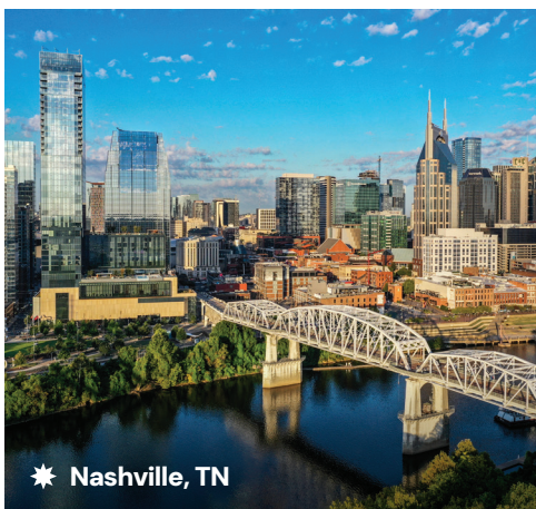
★ Nashville, TN

Today's drive south brings you through the rich farm country of Illinois to the rolling hills of Kentucky on the way to Nashville, Tennessee, known as "Music City" and the center of country music. In addition to music, the city offers a warm southern atmosphere, a growing culinary scene, and historical sites. After arrival, enjoy the evening at a lively honky-tonk on Broadway, one of Nashville's most famous music streets.