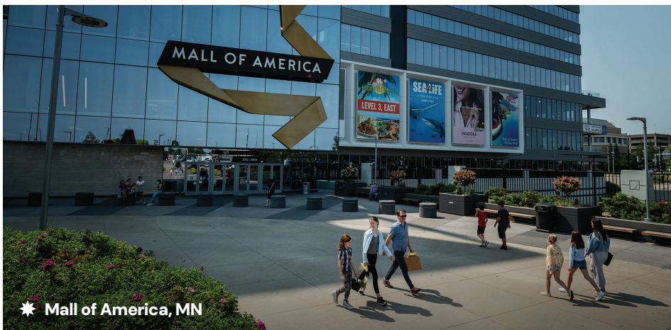
★ Mall of America, MN