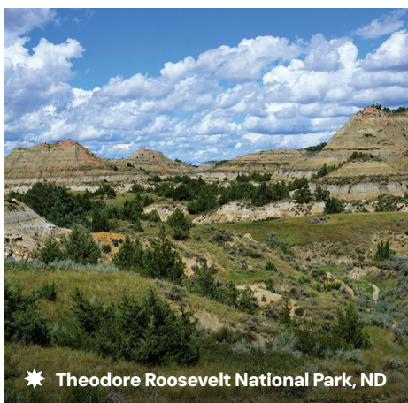
★ Theodore Roosevelt National Park, ND

On the drive west, stop in Jamestown to see the world's largest buffalo and the North American Bison Discovery Center. Upon arrival in Bismarck, visit the North Dakota Heritage Center and State Museum on the North Dakota State Capitol campus. Next a short drive to Mandan leads to old Fort Abraham Lincoln, which shows life as a frontier soldier in a living history demonstration. End the day with a sunset cruise aboard the Lewis & Clark Riverboat.