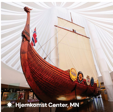
★ Hjemkomst Center, MN