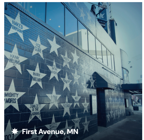
★ First Avenue, MN