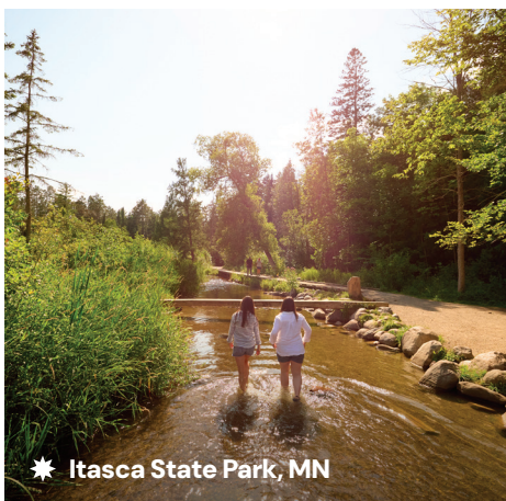
★ Itasca State Park, MN

Driving east this morning, first stop in New Town, home of the MHA Interpretive Center and earth lodge building, which tells the story of the Mandan, Hidatsa and Arikara Nations. Reflect on the beauty of the area at Lake Sakakawea. After arrival in Minot, walk through the Scandinavian Heritage Park, featuring buildings, statues and monuments that celebrate the heritage of the Nordic countries. And visit the Dakota Territory Air Museum, which features a variety of military and civilian aircraft as a tribute to the city's importance as an aviation training center.