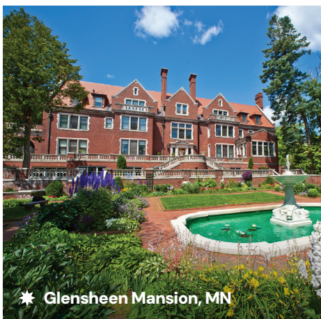
★ Glensheen Mansion, MN

Depart Duluth for the 2.5-hour trip back to Minneapolis/St. Paul. Take a walk along the Minnesota River at the Minnesota Valley National Wildlife Refuge in Bloomington or shop for some last-minute items at Mall of America—both are only five minutes from the Minneapolis/St. Paul International Airport (MSP).