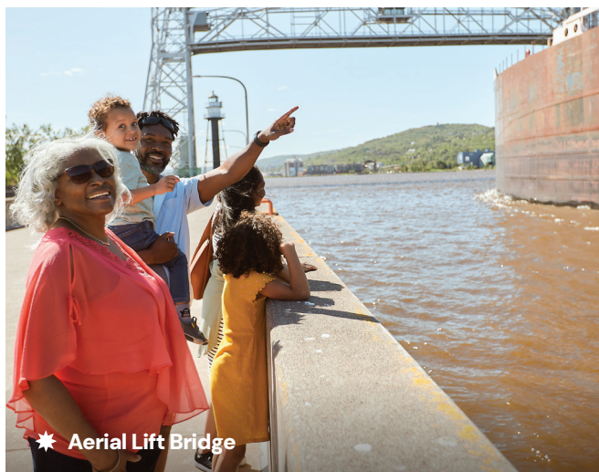
★ Aerial Lift Bridge