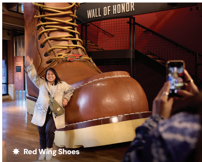
★ Red Wing Shoes

North of MSP, the gateway to Lake Superior's North Shore and the birthplace of Bob Dylan , Duluth is a must-see, no matter the season. Enjoy this western-most port of the Great Lakes and the iconic Aerial Lift Bridge on a scenic boat tour. Then browse the shops in the adjacent Canal Park District. Travel back to the opulence of the turn of the 20th century at Glensheen Mansion or ride the rails along the greatest of the Great Lakes with the North Shore Scenic Railroad . Highway 61— Lake Superior's North Shore All-American Scenic Drive , made famous by the Bob Dylan song—connects to the famous Split Rock Lighthouse and shore communities like Grand Marais , home to a unique artist colony. Duluth's holiday visitors will especially enjoy the Bentleyville "Tour of Lights," the country's largest walk-through lighting display alongside the bustling Port of Duluth-Superior . Autumn along the North Shore Scenic Drive rivals New England with its kaleidoscope of color perched along the greatest of the Great Lakes.