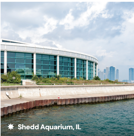
★ Shedd Aquarium, IL