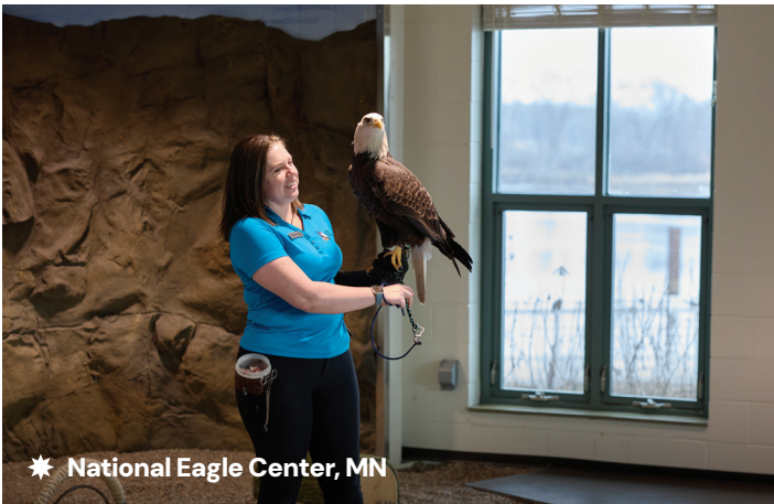
✦ National Eagle Center, MN

Home of the world-famous Mayo Clinic, green parks, historic sites, and boutique shopping, Rochester offers an interesting variety of architects for visitors. A great way to see the city is on a Rochester Trolley Tour—examples are the Queen City History Tour or To Heal the Sick: Rochester and the Mayo Clinic. Historic homes of the founding Mayo Clinic doctors tell the story of the famous clinic and include the Mayowood Historic Home and the Plummer House of the Arts.