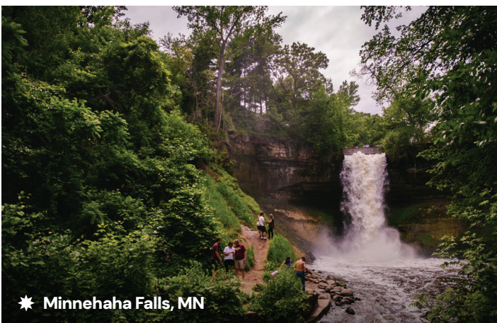
✦ Minnehaha Falls, MN

Continue the drive along the Mississippi River to the Twin Cities of Minneapolis and Saint Paul. Discover why Minneapolis is called the “City of Lakes.” Stop at Minnehaha Falls to learn about the early Native American legends of the area. View Historic Fort Snelling and the beautiful Landmark Center in Saint Paul with the gangster history of the city. Then it’s off to an evening of shopping, entertainment and dining at Mall of America, the largest enclosed shopping and entertainment center in the U.S. And there’s no sales tax on clothing or shoes in Minnesota!