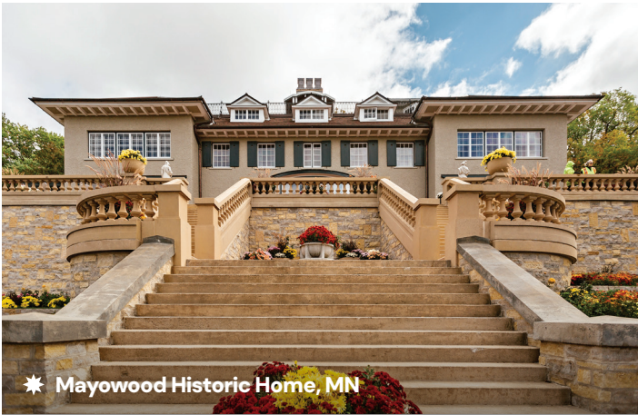
✦ Mayowood Historic Home, MN

Drive through the rolling hills of Wisconsin to Winona, a river town located on the Mississippi River in the bluff country of the famous river. The history of Winona is told through several unique museums including the Watkins Heritage Museum and Gift Shop and the Polish Cultural Institute and Museum. And a walking tour of downtown showcases the historic architecture and stained-glass splendor of many buildings.