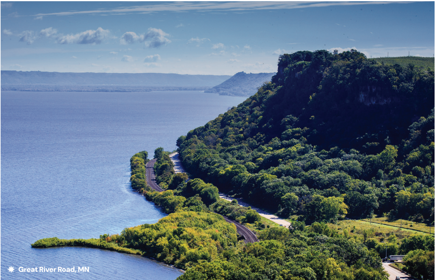
★ Great River Road, MN