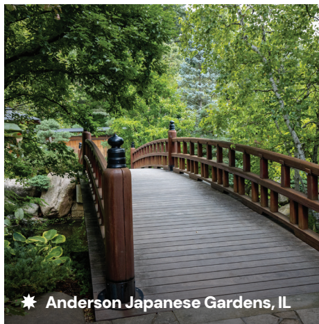
★ Anderson Japanese Gardens, IL