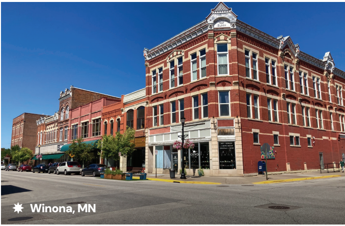
✦ Winona, MN