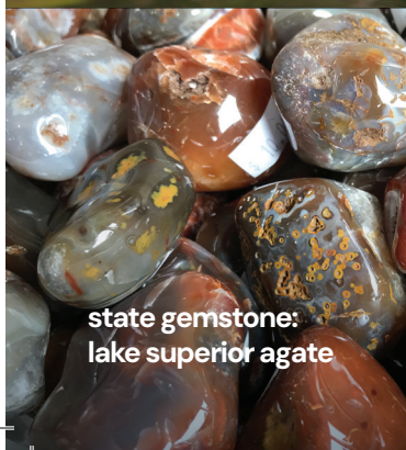
state gemstone: lake superior agate