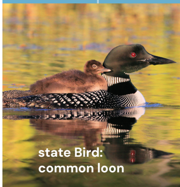
state Bird: common loon