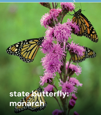
state butterfly: monarch