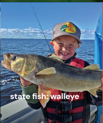
state fish: walleye