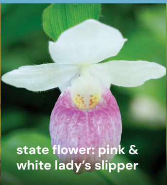
state flower: pink & white lady's slipper