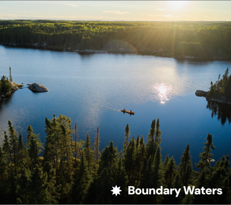
★ Boundary Waters