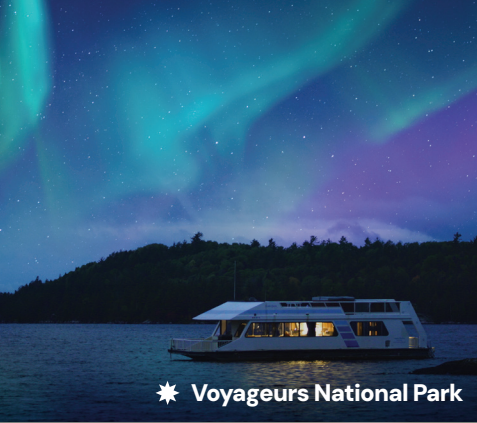
★ Voyageurs National Park