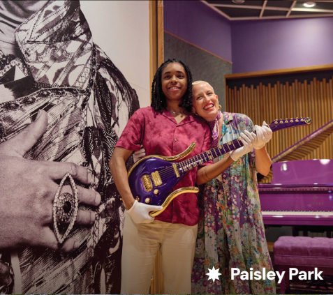
★ Paisley Park