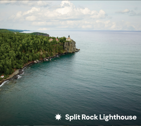
★ Split Rock Lighthouse